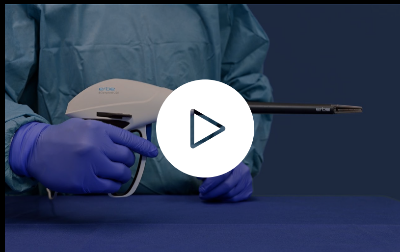
How to use